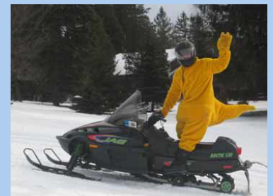
Check out more Senior Sleepover fun on Page 5!